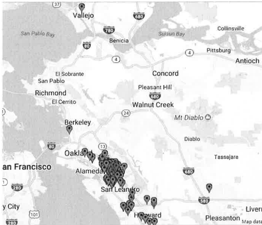
ACA Zoom Out