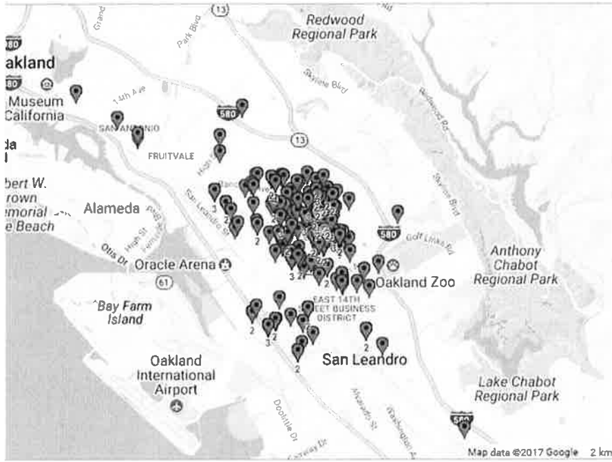
ACA Zoom In