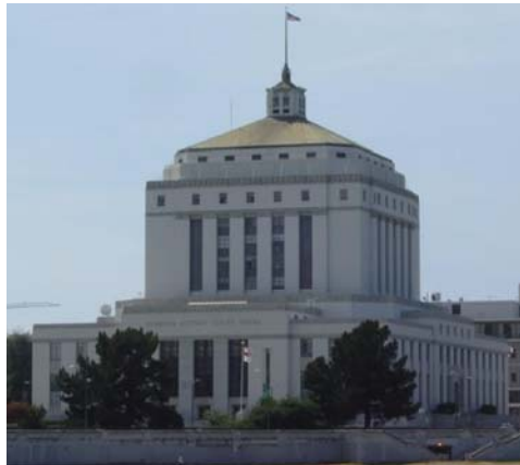
Rene C. Davidson Courthouse, 1225 Fallon Street, Oakland, California