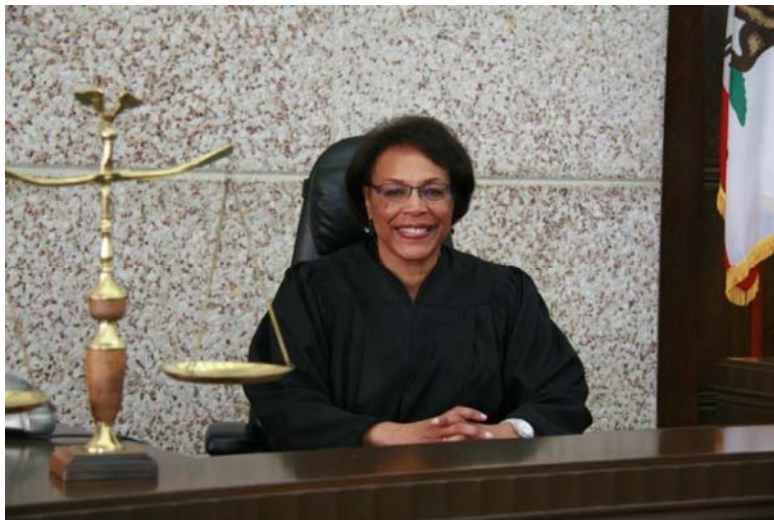
Honorable Winifred Y. Smith January 1, 2014 – December 31, 2015